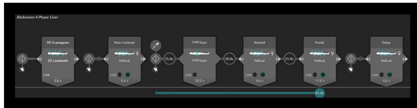
Figure 1: Four Phase liver scan protocol with intuitive left-to-right scan progression.

The result of this initiative is a new interface that significantly reduces the learning curve for healthcare professionals, with most users requiring less than half a day of training to feel confident operating the system. Additionally, the intuitive design reduces workflow steps by 40%*, helping to reduce operator stress.