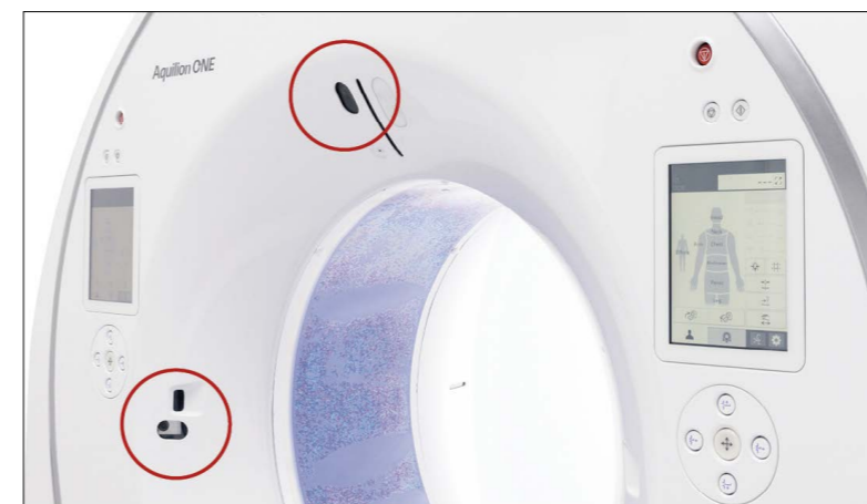
Figure 2: Dual gantry mounted cameras