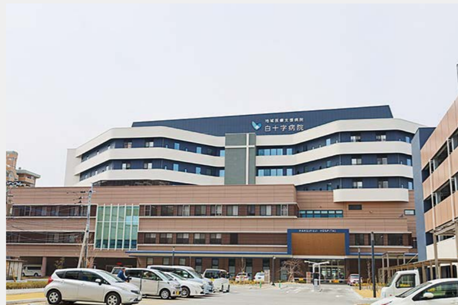
Hakujuji Hospital, Japan